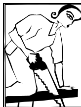
Handyperson 'Odd Jobs' Home Maintenance Courses