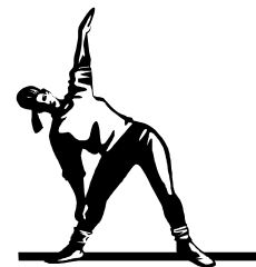
New Moves - Fitness