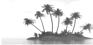
Mindfulness (Carers Included)