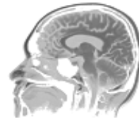
Brain Gym (Carers Included)